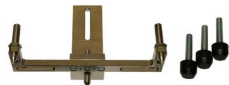
Workpiece support for plain workpieces