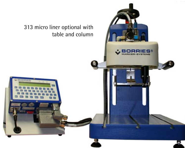
313 micro liner optional with table and column

*) CO = construction option, will be defined by placing of order – no additional charge; A0 = additional option, can be ordered additionally – additional charge