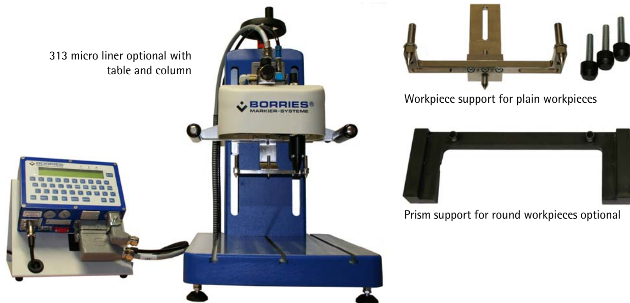
313 micro liner optional with table and column

*) CO = construction option, will be defined by placing of order – no additional charge; A0 = additional option, can be ordered additionally – additional charge