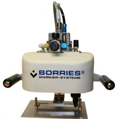
313 micro liner with hand grips