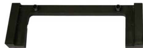
Prism support for round workpieces optional

Technical details are subject to change.